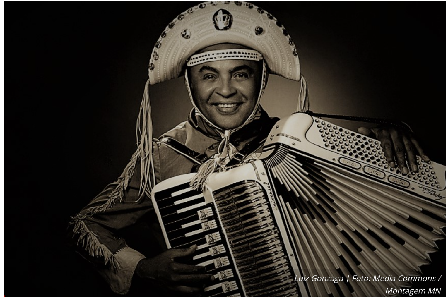
Luiz Gonzaga